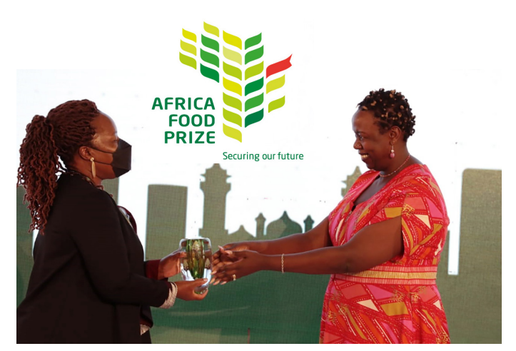
ICRISAT received the Africa Food Prize, 2021.

ICRISAT Zimbabwe was established in 1983, in line with the country's strategic plans. The center's efforts are dedicated to enhancing agricultural productivity, eradicating hunger, improving nutrition, and promoting sustainable agriculture. ICRISAT addresses micronutrient malnutrition through improved sorghum, millet, and groundnut varieties. Smart water management tools and Agriculture Innovation Platforms have yielded impressive results in communal irrigation schemes.